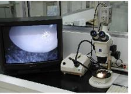
Stereomicroscope for distortion, whitening, crazing and porosity tests