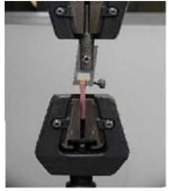
Universal machine for bonding test